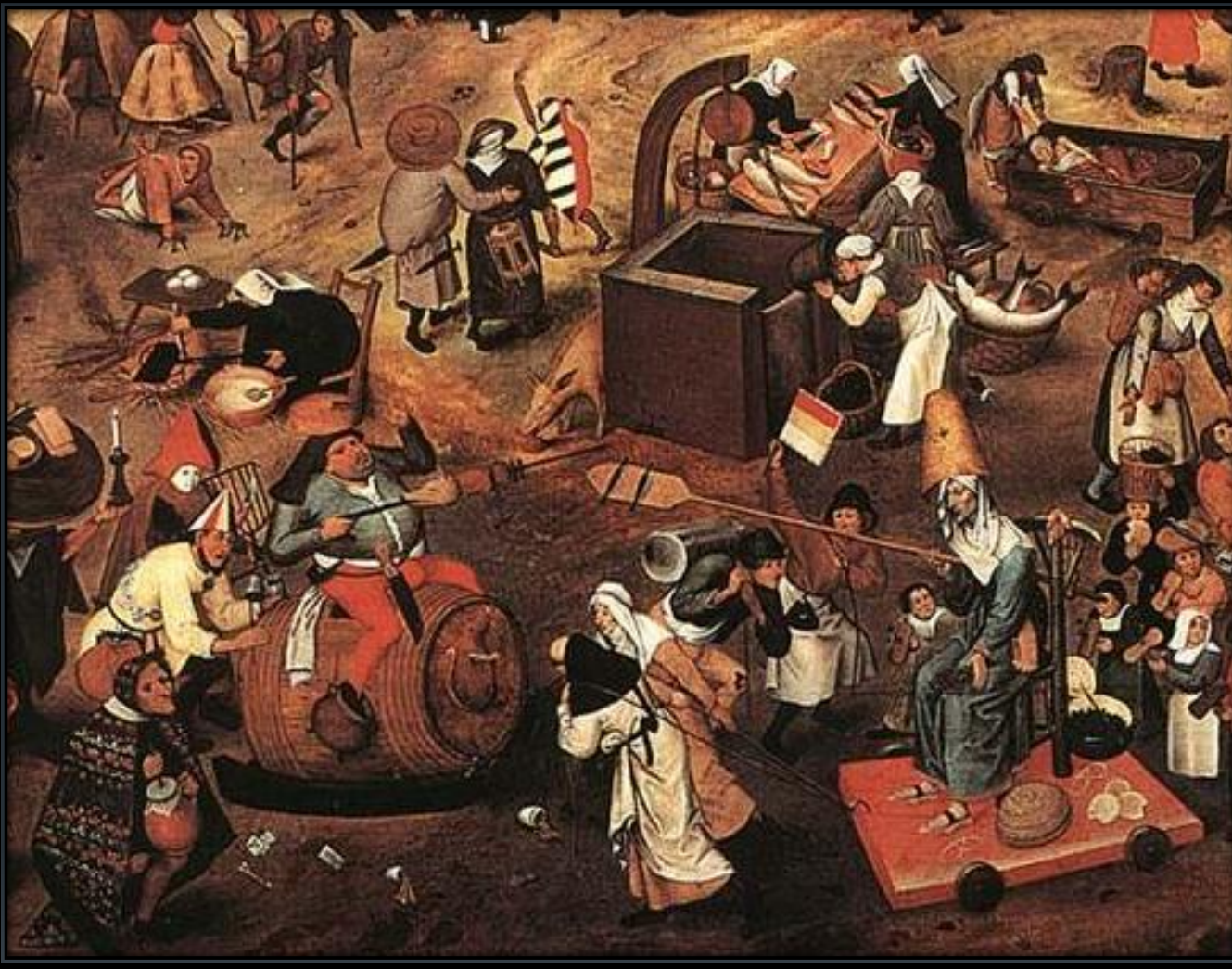
“The Fight Between Carnival and Lent” (detail), 1559