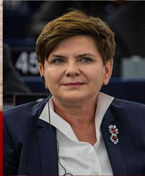
• Beata Maria Szydło