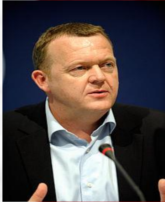
Lars Løkke Rasmussen