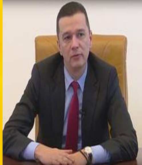
Sorin Mihai Grindeanu