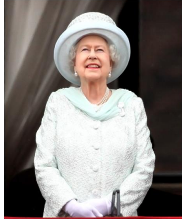
Queen voices her gratitude to say how she is humbled by Jubilee celebrations