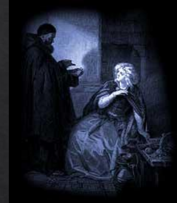
Romeo & Juliet