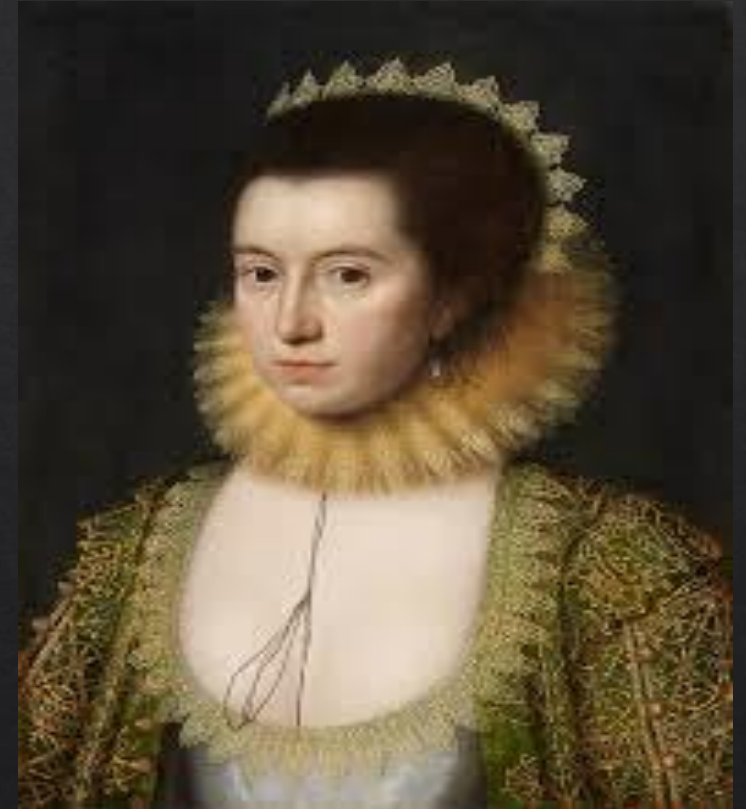
Anne Hathaway, his wife.