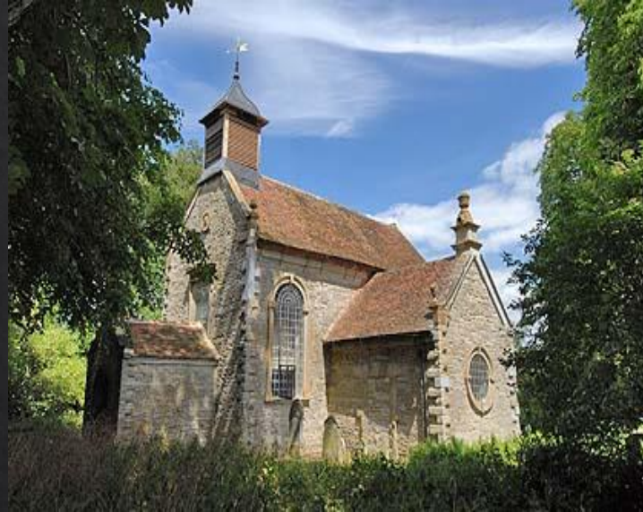
The church Shakespeare's wedding took place.