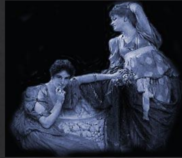
Antony & Cleopatra