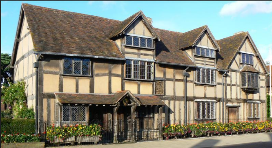
The house where he was born.

William Shakespeare was born and brought up in Stratford upon Avon, Warwickshire. At the age of 18, he got married to Anne Hathaway. His parents were John and Mary.