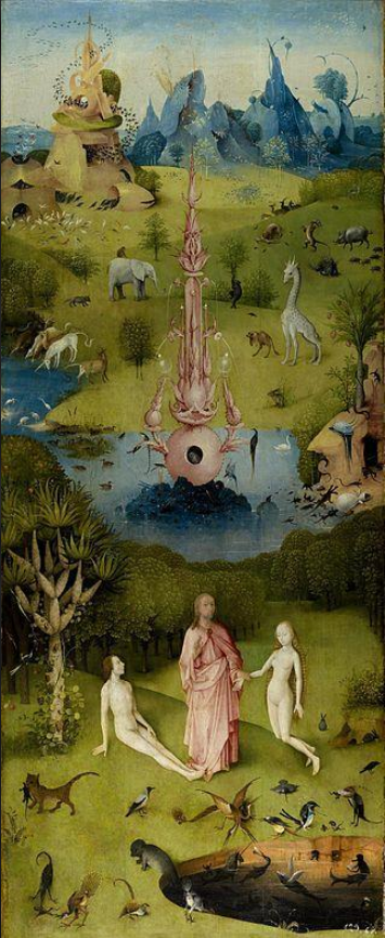
Paradise with Adam and Eve and many wondrous animals.