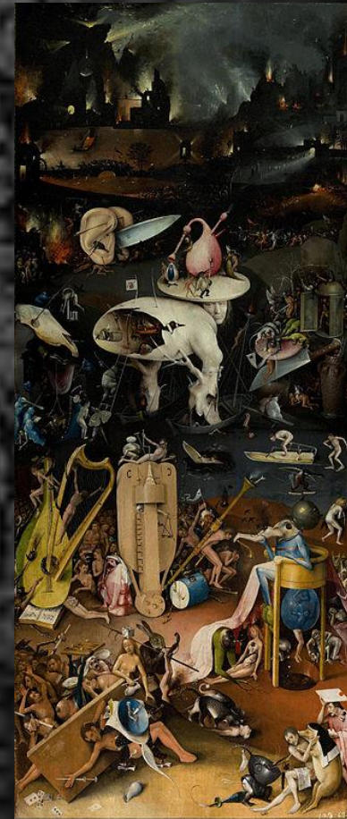
Hell with depictions of fantastic punishments of the various of sinners.