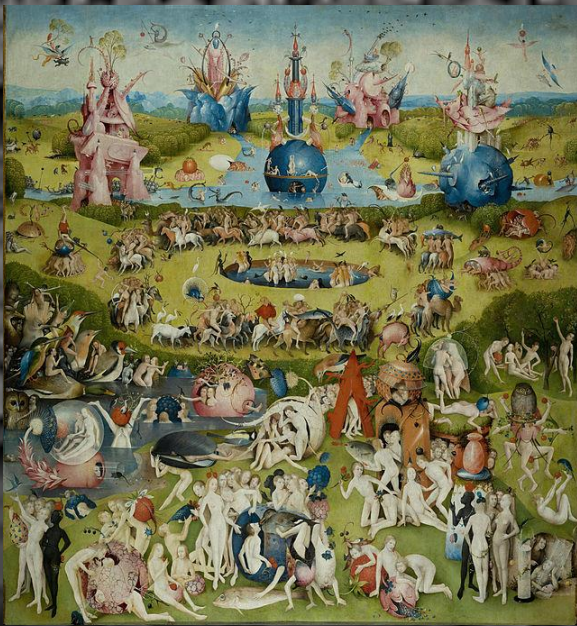
The earthly delights with numerous nude figures and tremendous fruits and birds.