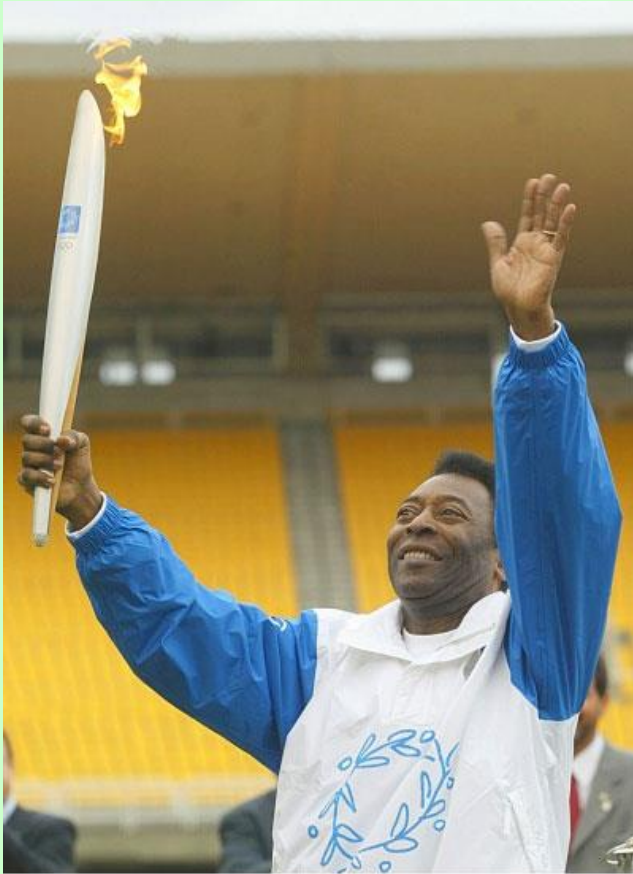
Pele carries the Olympic Flame inside Maracena Stadium during Day 10 of the ATHENS 2004 Olympic Torch Relay June 13, 2004 in Rio De Janeiro, Brazil.