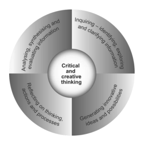
The ACARA Model of Critical and Creative Thinking

Although 'inquiring' is explicitly identified as only one of the elements in the ACARA model, very little analysis is required to show that all of the elements can be recast in that form. This is because inquiry involves identifying, clarifying and exploring questions, issues and problems in ways that accommodate the other three elements. First, inquiry involves a search for solutions, resolutions or answers that proceeds in the face of competing ideas and possibilities. So it generates possible responses and innovative ideas—suggestions, proposals, hypotheses, and the like such as we find in the 'generating' sector of the ACARA model. Secondly, in an inquiry these ideas and possibilities are only tentative solutions, thoughts about how things might be decided, or possible answers to questions, until they are properly examined and assessed; and putting such ideas and other suggestions to the test means analysing them, connecting and combining them, as well as evaluating them, as in the 'analysing/synthesising/evaluating' element. Finally, any well-developed inquiry will have a meta-cognitive dimension in that inquirers keep one eye on the inquiry process, consciously and deliberately implementing procedures and reaching for tools that will carry the inquiry forward in a structured and systematic way, in accord with the 'reflecting' element in ACARA's model.<sup>4</sup> In all, then, inquiry mirrors all four elements of the ACARA model of critical and creative thinking.